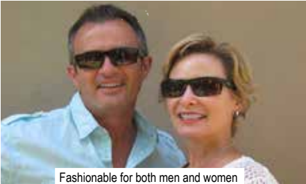
Fashionable for both men and women

For polarised sunglasses of this quality - without our unique lens - you could easily pay $200 upwards. But because we don’t sell to shops (no middlemen) we can supply them directly to you for just $89 plus $10 postage & handling. Each pair comes with an attractive carry case and has a full One year warranty .