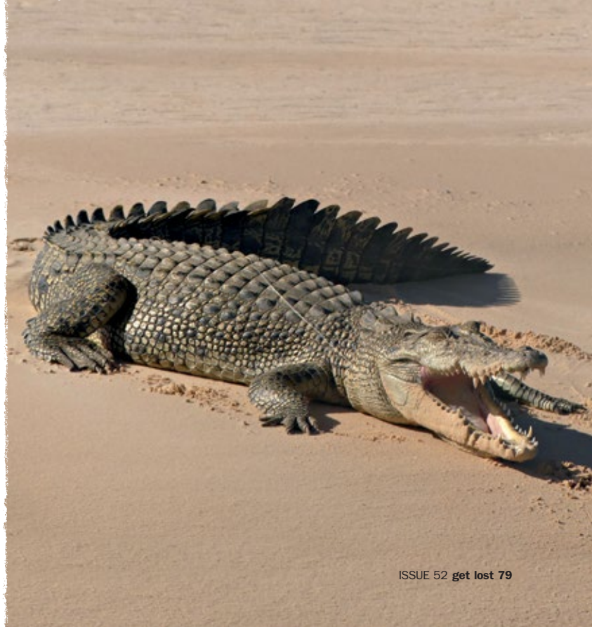
Resident croc at the Berkeley River mouth.

It's a theme echoed in the main lodge, where glass doors are thrown open to the deck. An infinity pool offers a refreshing dip before pre-dinner drinks, when excursion options for the following day are discussed. Degustation dinners feature the likes of barramundi paperbark parcels, Sichuan peppered kangaroo fillet, and slow-roast, herb-crust lamb.