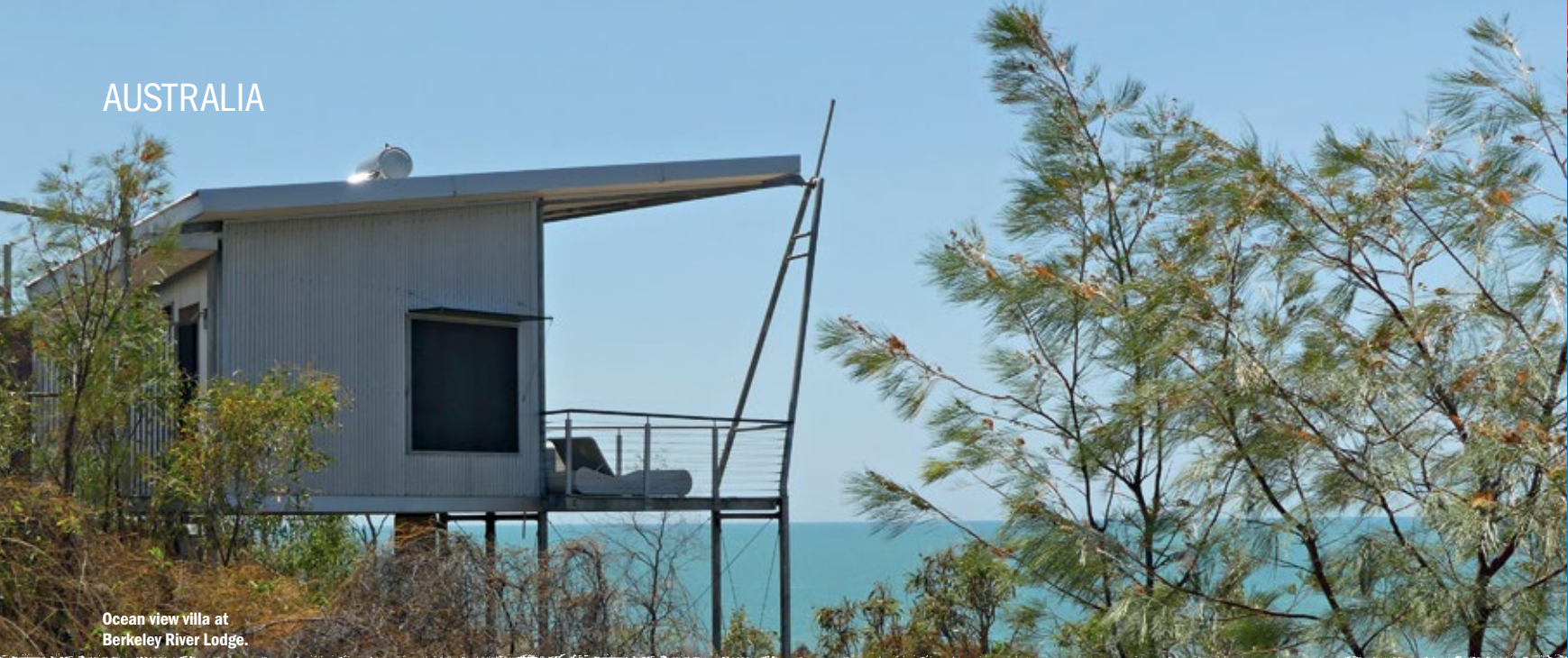
Ocean view villa at Berkeley River Lodge.