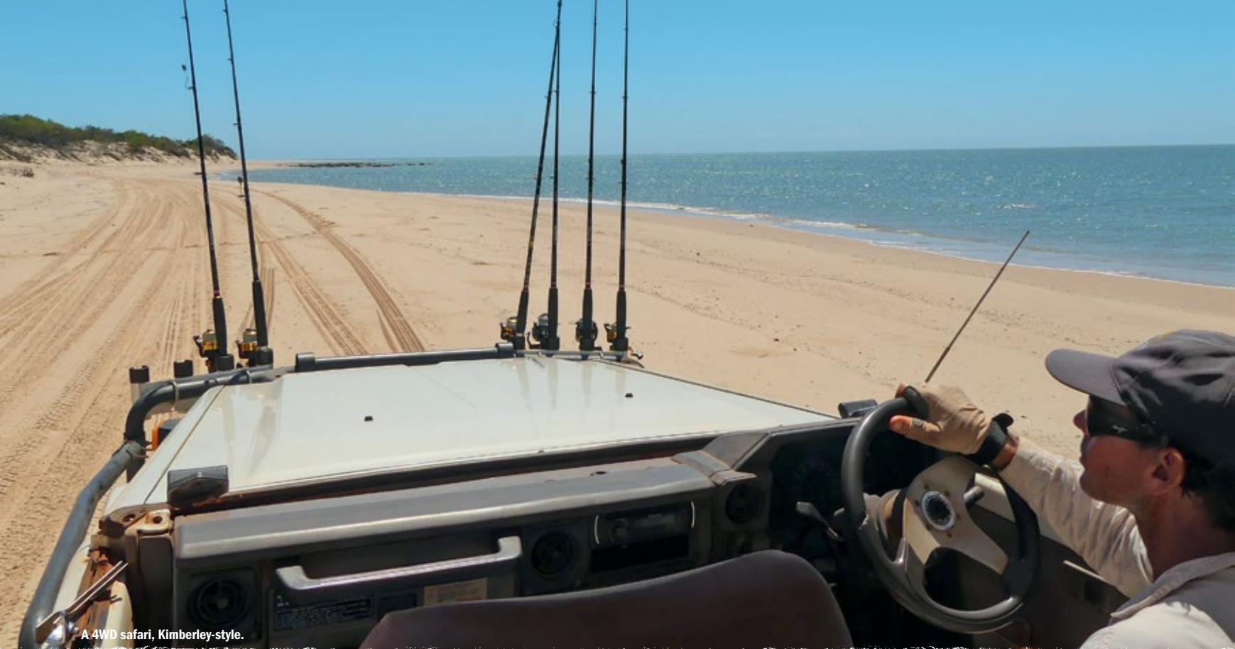
A 4WD safari, Kimberley-style.

Swerving in from the Timor Sea, our frothy wake billows behind us like a wedding veil caught in the wind. Leaving the ocean behind, our steel runabout breaches the coastline, plunging inland up an unnamed creek. We slalom through its curves as the surrounding rocks grow in stature and mangroves encroach from either side, funnelling us into the ever-narrowing gorge. When we can go no further, our guide, Bruce Maycock, throttles back. We drift – embraced by the Kimberley.