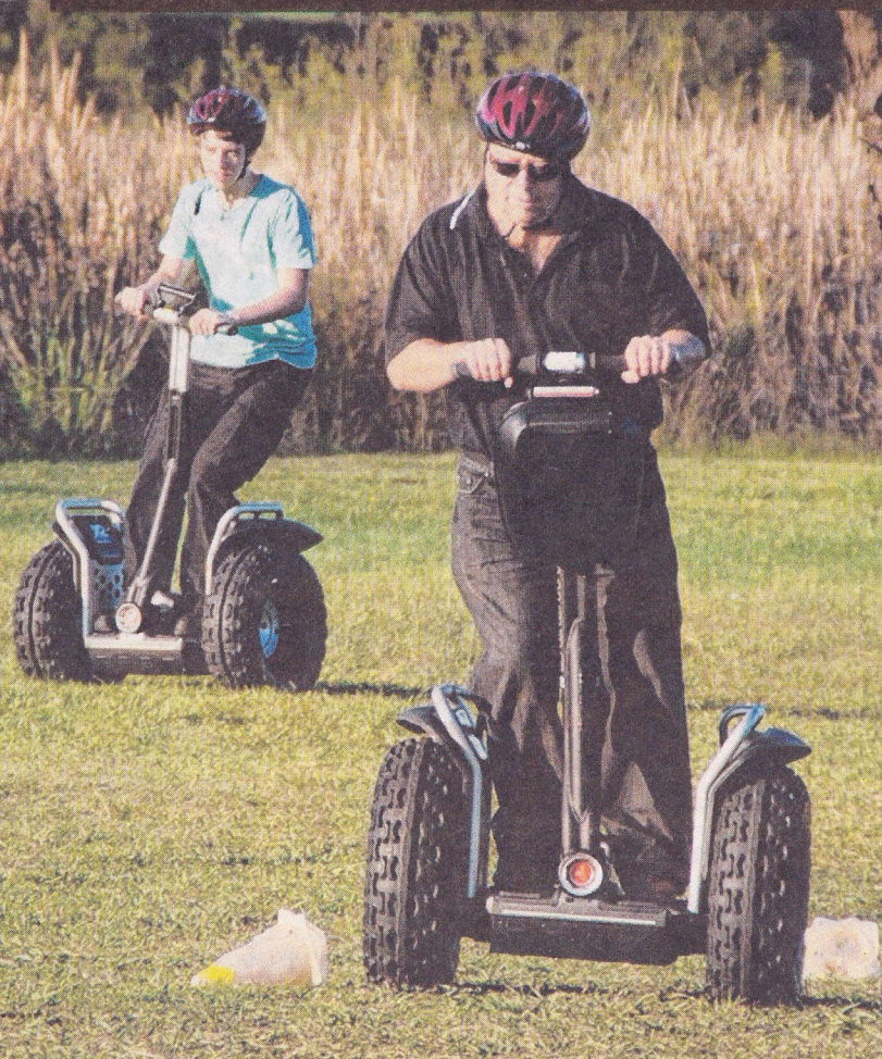
FUTURE CHIC: Segway slalom races (above) demonstrate the machines' versatility; and the Segway adjusts to any terrain (right).