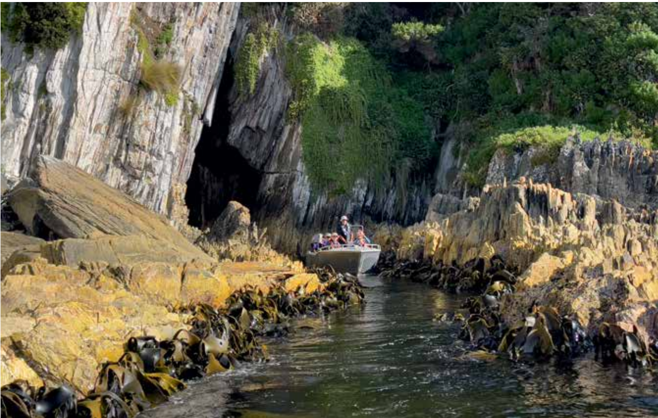
An Odalisque tender squeezes through kelp-lined caves in the Breaksea Islands.